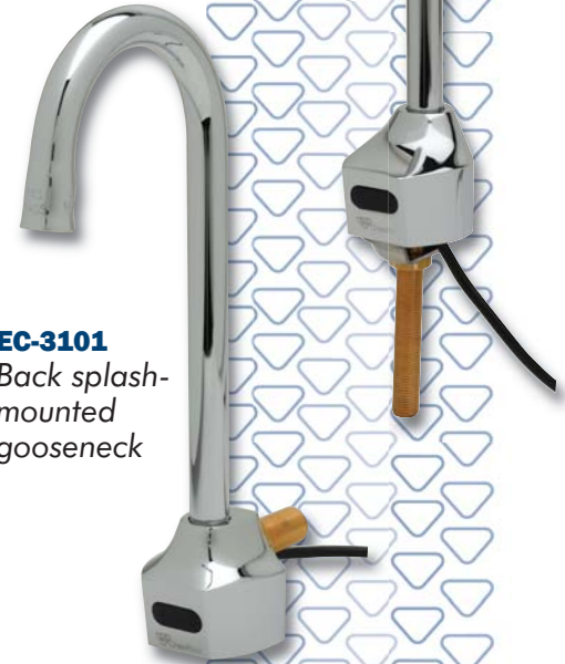
EC-3101 Back splash-mounted gooseneck